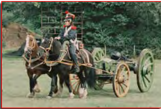
French Imperial Guard horse-drawn artillery at Military Odyssey, Kent, over the August Bank Holiday 2006.